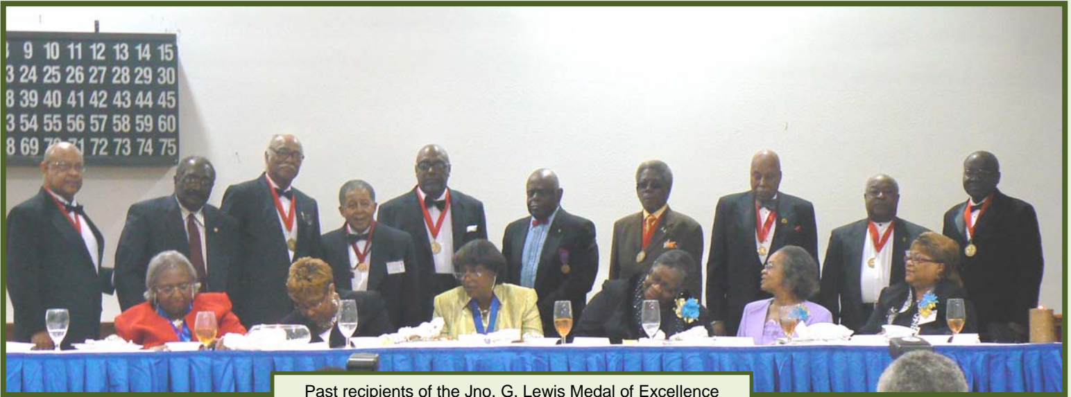
Past recipients of the Jno. G. Lewis Medal of Excellence