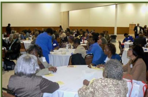
Phyllis Chapter Luncheon