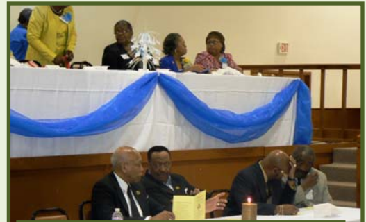
Phyllis Chapter Luncheon

We were amazed at the huge banquet halls, Grand East and Grand Chapter rooms. The entire facility is a blessing to the AR PHA Family and it was good to see Freemasonry on the move in Pine Bluff.