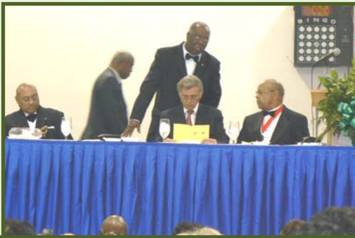
Hon. Mike Beebe, Gov. of AR