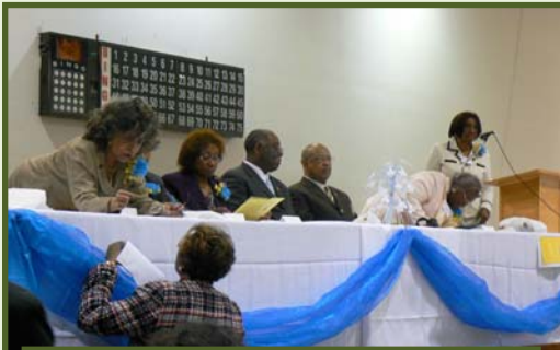
Phyllis Chapter Luncheon

I attended the Phyllis Chapter's luncheon on Friday afternoon. We were graciously served by volunteers from the WMPHGL of AR.