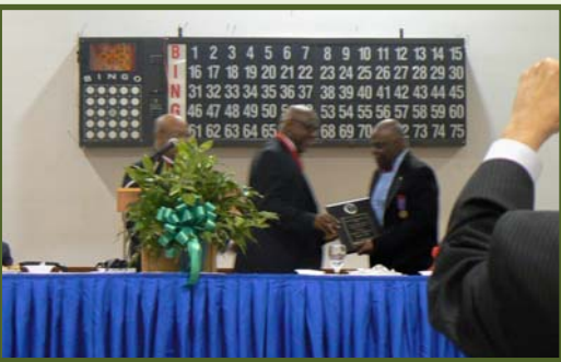
Doric Chapter (MD) receives the Chapter of the Year Award