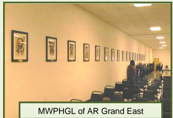
MWPHGL of AR Grand East