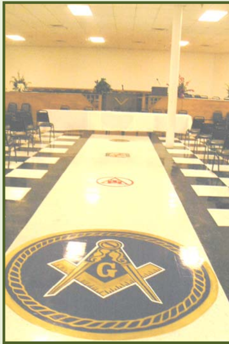
MWPHGL of AR Grand East

When I arrived in Pine Bluff we were escorted to the Grand East which the MWPHGL of Arkansas has recently purchased. The building was extremely large and spacious; we were excited to also be treated to a tour of the facility.