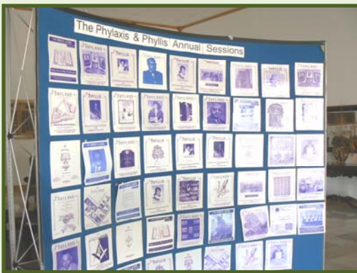
Past Phylaxis Magazines