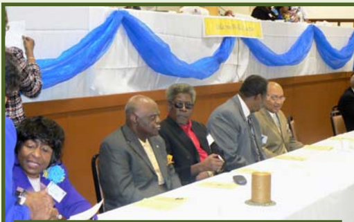
Phyllis Chapter Luncheon