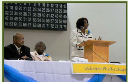
Phyllis Chapter Luncheon