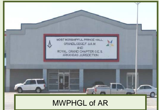
MWPHGL of AR