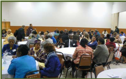
Phyllis Chapter Luncheon