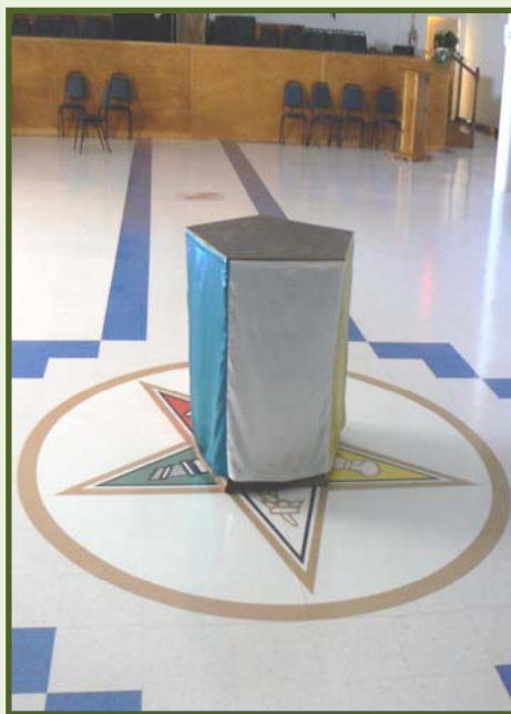
O.E.S. Grand Chapter Room